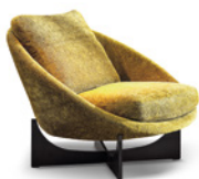
04 LIDO ARMCHAIRS WITH BASE CM 93X99 H85