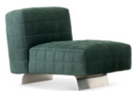
05 TWIGGY LARGE ARMCHAIR CM 84X90 H66