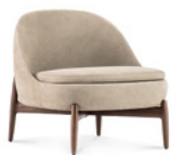
05 SENDAI ARMCHAIRS CM 74X76 H72