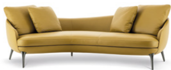
01 RAPHAEL INCLINED SOFA CM 247X135 H88