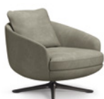
02 RAPHAEL SWIVEL ARMCHAIRS CM 74X86 H78