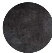
07 DIBBETS RUG Ø CM 400 - SPECIAL SIZE