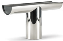
08 PILOTIS CONSOLLE CONSOLE TABLE CM 140X36 H75