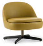
04 SENDAI LOUNGE SWIVEL ARMCHAIRS CM 65X67 H67