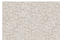
09 WISP RUG CM 500X400