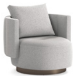
03 TORII BOLD SWIVEL MEDIUM ARMCHAIRS CM 88X88 H82