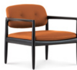
05 YOKO ARMCHAIRS CM 77X75 H73