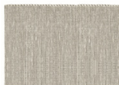
13 OSAKA RUG CM 600X500