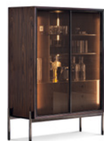
12 SUPERQUADRA VERTICAL CABINET CM 105X45 H141