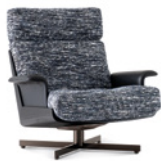
03 DAIKI SWIVEL BERGÈRE CM 94X94 H93